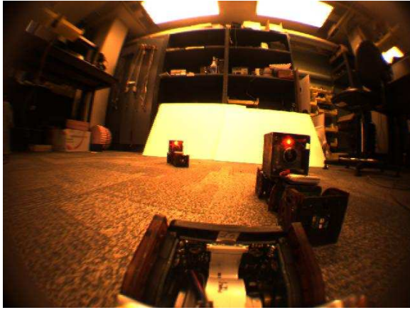
Fig. 4. This figure shows an image taken by one of the smart camera systems mounted on one of the clusters.

are individualized. In this scheme, each camera can determine the bearing to another as soon as there is a line of sight between two camera nodes. The size of the blinking light in the image is a function of relative angle and distance between the two camera nodes. Although this size is not a good indicator of range when the camera nodes are far apart, our experience shows it is a very effective measure at close range. This fits perfectly with docking where accurate measurements are only needed when the modules are close [10]. Figure 4 shows an image acquired by one of the camera modules during the docking procedure while Figure 5 shows how the size of the blinker in the image changes as a function of distance.