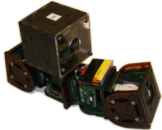
Fig. 1. Each cluster in the modular robot is composed of four CKBot modules and a smart camera system.

The individual modules can be connected to each other either using screws or through a set of magnetic linkages. These magnetic linkages are implemented using an array of rare earth magnets embedded in the connector faces of the modules. Four north facing and four south facing magnets arranged such that two opposing faces will attract each other. The magnets have enough strength hold a chain of seven modules together against gravity. These novel magnetic linkages enable modules in an assembly to dynamically attach or disconnect from each other.