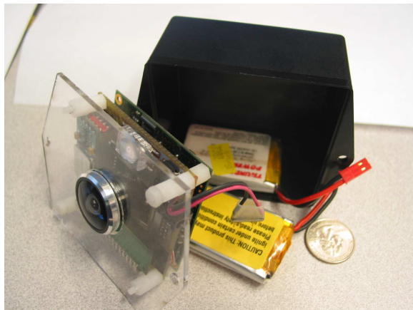
Fig. 2. Each smart camera module is equipped with an imager outfitted with a fisheye lens, a digital signal processor, an accelerometer, a CAN bus transceiver, and an LED signalling light

This approach allows the camera node to both localize and uniquely identify neighboring nodes since the blink patterns